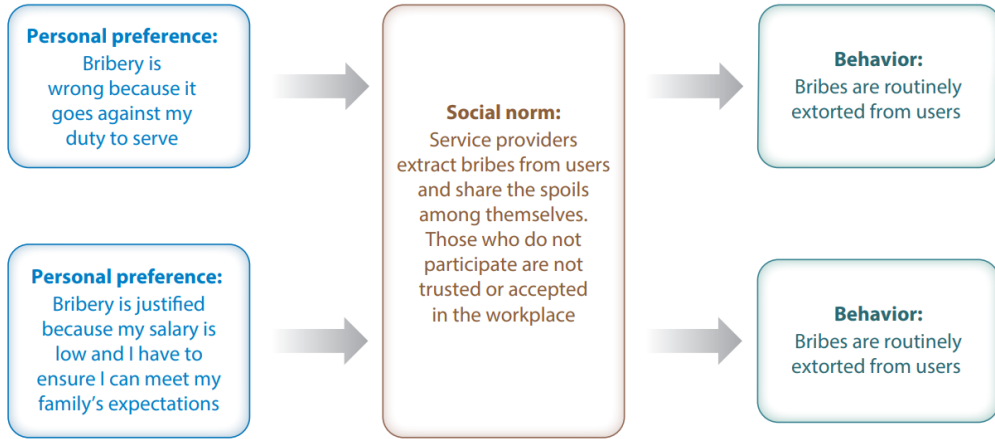
Figure 2: social norms resulting in and perpetuating corrupt behaviour (Kubbe, Baez-Camargo and Church 2024:430)

An example of a social norms change approach in countering corruption could be to focus on shifting perceptions of the descriptive norm (what people think others do) to reduce corrupt acts or conduct a public awareness campaign highlighting bribery as being not as widespread as people think (Kubbe, Baez-Camargo and Church 2024). However, while social norms change could be useful in countering corruption (and gender inequality) there have been very few tested social norms anti-corruption interventions in the real world (Kubbe, Baez-Camargo and Church 2024).